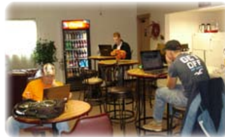
ALASKA ASYMCA OFFERS A PLACE FOR OFF-DUTY SOLDIERS TO RELAX.

To garner more support for our programs and services on Fort Wainwright and Eielson AFB, an Advisory Committee was established in Fairbanks. The Committee is made up of civic minded leaders who will help in our efforts to service troops at a satellite site that is more than 370 miles away from our main offices in Anchorage.