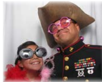
DAUGHTERS ‘SPRUCE UP’ THEIR FATHERS FOR PHOTOS THEY’LL NEVER FORGET.

The San Diego Armed Services YMCA was recognized by the Drew Brees Dream Foundation . Drew Brees announced that he is the new host of the annual Cox Celebrity Golf Championship at the Morgan Run Golf Course and the proceeds from this