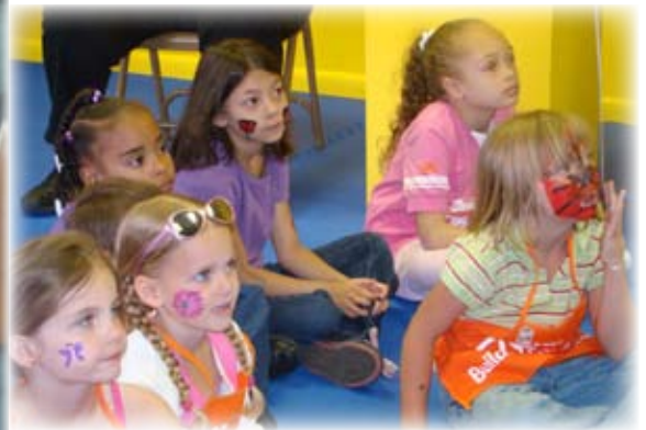
SERIOUS LOOKS ON PAINTED FACES.

neighborhood. The kids loved the adventure and the parents enjoyed being able to sit down and rest!