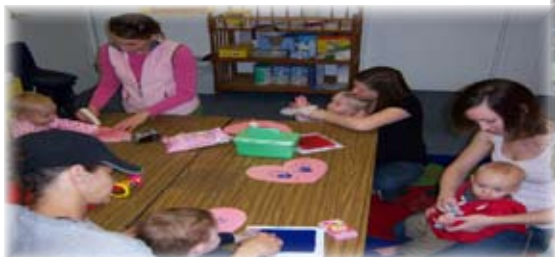
PARENTS AND THEIR CHILDREN MAKING VALENTINES.

Classes also teach children their numbers, ABCs, colors, shapes etc. The class is for one hour four days a week. In that one hour the children have playtime, circle time, craft time, and snack time.