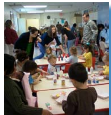
ART CLASSES ARE BOTH FUN AND EDUCATIONAL.

involves weekly themes, age appropriate activities, self-directed and teacher-directed playtime, center play, and two nutritious USDA certified meals and a snack a day. Many of our moms use this program in order to take college courses without the added cost of childcare. Parents and children alike look forward to coming to the Co-op. Average weekly attendance is 35 children and 15 adults.