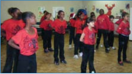
AFTER SCHOOL KIDS CREATED A STEP TEAM AND PERFORMED DURING THE CHRISTMAS PARTY.

This year, for the very first time the ASYMCA Child Development Center in El Paso earned accreditation through the National Association for the Education