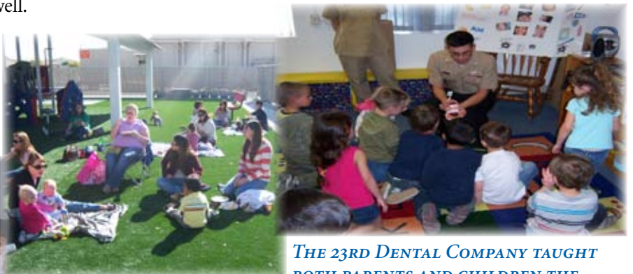
FAMILIES ENJOYING THE Y PLAYGROUND.

THE 23RD DENTAL COMPANY TAUGHT BOTH PARENTS AND CHILDREN THE IMPORTANCE OF TAKING CARE OF TEETH THROUGH DENTAL HYGIENE DURING DENTAL HEALTH MONTH IN MARCH.