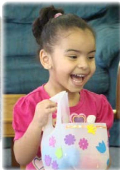
LOTS OF SMILES TO GO AROUND.

the huge wall, bouncing in the Pirates of the Caribbean castle, playing basketball, seeing how fast they could throw a baseball or how high they could jump. A new addition to our event this year – and a huge hit – was the train that rode around our