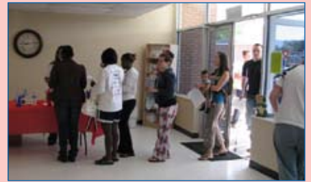
6 TO 8 SHOPPERS WERE ALLOWED IN AT 15-MINUTE INTERVALS.

Winston-Salem, NC. The food bank provides a vital service since the only other one the area is run by the Salvation Army and is located in Jacksonville.