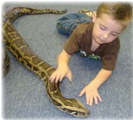
NO FEAR OF REPTILES HERE.

In February we added Martial Arts classes to our growing list of services. The Youn Wha Ryu system of Martial Arts and Tai Chi training principles fit right in with the character development traits of the YMCA. In March, the instructors held a free self defense seminar for moms and daughters, where the women learned