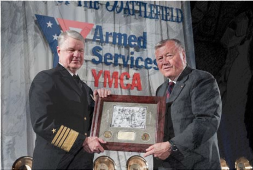
GENERAL EUGENE HABIGER, USAF (RET), ASYMCA NATIONAL BOARD CHAIRMAN PRESENTS ADMIRAL GARY ROUGHEAD, USN A PLAQUE HONORING OUR ANGELS OF THE BATTLEFIELD.