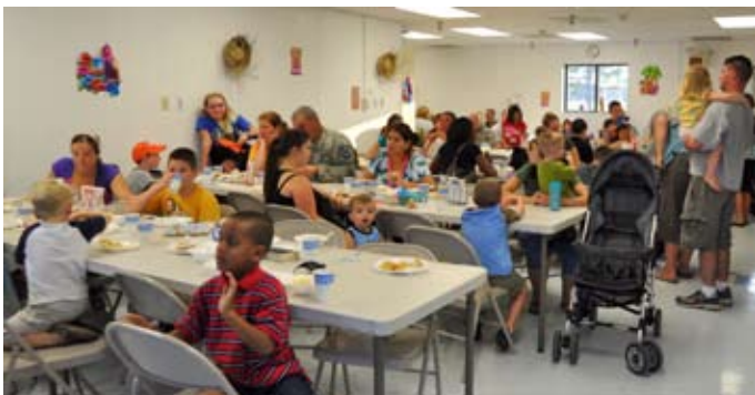
FAMILY DINNER AT Ft. CAMPBELL ASYMCA PROVIDES NUTRITIOUS USDA APPROVED MEALS.

The Ft. Campbell Armed Services YMCA presents a one-of-a-kind Co-op Daycare program which allows a spouse