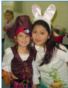
PIRATES, BUNNIES, PRINCESSES AND SUPERMAN TOOK ADVANTAGE OF HALLOWEEN SAFE TREAT NIGHT.