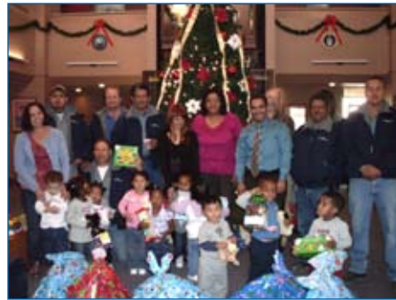
SOME OF THE 340 CHILDREN WHO RECEIVED CHRISTMAS GIFTS.

the El Paso CDC has been recognized through the Texas Rising Star program as a quality child development center, but receiving national accreditation demonstrates an even higher level of standard for the center. "NAEYC Accreditation lets families in our community know that children in our program are getting the best care and early learning experiences possible. The Child Development Center is one of the first programs in the country to earn the mark of quality under the new accredita-