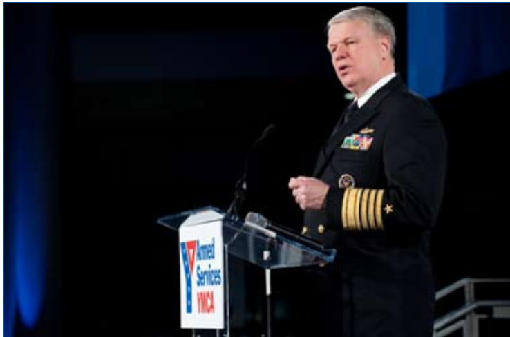
ADMIRAL GARY ROUGHEAD, CHIEF OF U.S. NAVAL OPERATIONS.