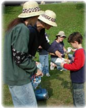
MOTHER/SON ADVENTURE WAS INTRODUCED TO COMPLEMENT THE FATHER/DAUGHTER DANCE.

It was a rough year for our military families in Alaska. For most of the year, we had over 10,000 troops deployed to Iraq and Afghanistan and our programs and services were needed more than ever.