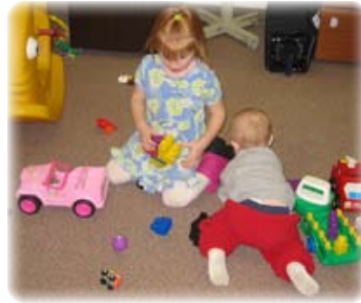
A NEW TEDDY'S CHILD WATCH WAS OPENED AT BASSETT ARMY MEDICAL CENTER.

many mothers who wanted an event similar to our annual Father/Daughter Dance, we held our first Mother/Son Adventure at Otter Lake on Fort Richardson in August 2009, which received raved reviews.