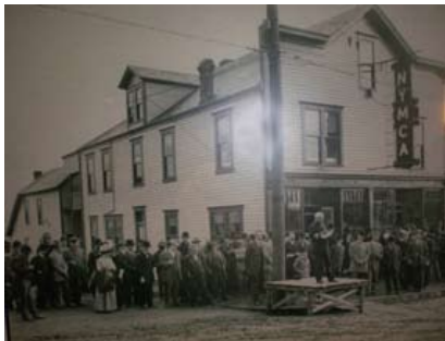
FIRST Y BUILDING - 1913

This was not an easy decision as the Armed Services Y branch has been an essential