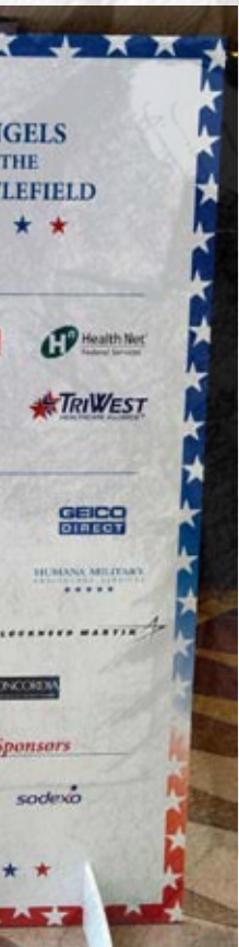
SPONSORS WHO MADE IT POSSIBLE.