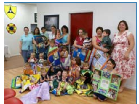
KID COMFORT VOLUNTEERS, PARENTS, AND CHILDREN PROUDLY DISPLAY THEIR BLANKETS AND PILLOW SHAMS

Healthy Kids Day in May attracted over 1,200 children. And we partnered with the Killeen/Heights Rotary Club to host a family event