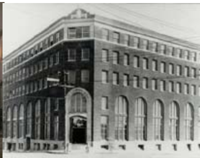
NAVY YMCA - 1924