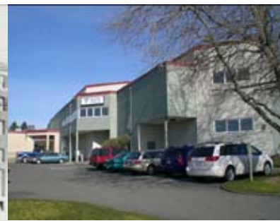
CURRENT Y BUILDING - 2010

part of the military fabric of the community for so long. We have appreciated our long association with ASYMCA and all that they have done for our branch over the decades.