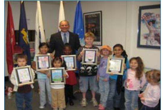
ART CONTEST WINNERS.

the Camp Pendleton Branch will offer the academic Camp Hero and a camp for children with disabilities, in addition to two resident camps at Yosemite National Park and a tall ship cruise in July.