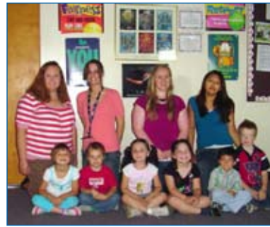
CHILD CARE AND SCHOOL PROGRAMS CONTINUE TO GROW AND THRIVE.

November was time for the annual Thanksgiving Food Basket give-out to a military family in need. All the food is donated and delivered by the staff in a "Y" bus to the selected family. The family that was selected this year was a young E-4 with 3 young children, who just happened to have a dog that had given birth to puppies 7 weeks earlier. It was a fun time delivering the food basket and seeing the family's happiness at their gift of food