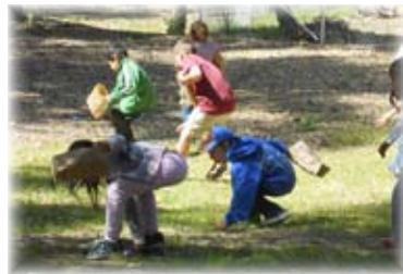
YOUNGSTERS GET SERIOUS ABOUT EASTER EGG HUNT.

fathers and their sons and daughters enjoyed a full day of fishing together. While all enjoyed the excitement of catching a fish, the fish won also, as they were all returned to the lake. The fishing was followed by an Easter Egg Hunt and family picnic. Family Bonding at its best!