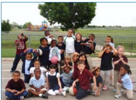
HAVING FUN AT THE ASYMCA AFTER SCHOOL PROGRAM

During 2009, the Killeen Armed Services YMCA continued to develop and expand its programs and services