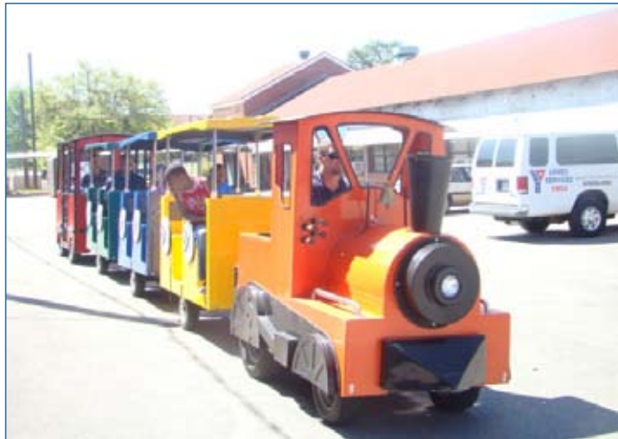
THE ONLY WAY TO TRAVEL.

Healthy Kid's Day continues to be a popular event and this year was no exception. All of the favorite exhibits and demonstrations drew more than 1,000 people. Children were able to construct a bughouse or an herb garden planter in the workshop section. Children competed to see who could blow the biggest bubbles and watched them float away and then burst in the air. Toddlers with no fear held snakes of all shapes and sizes, and sat on the floor petting a 12 foot, 140 pound Burmese Python, while moms and dads looked on in horror! What a joy it was watching children with painted faces participating in the puppet show about deployed parents, crawling out of the smoke house, climbing