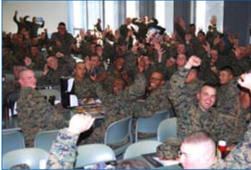
MARINES ENJOY THE SUPER BOWL.

The Camp Pendleton Branch completed a significant achievement ending 2009 being able to provide all the programs and services with reduced revenue due to the economy. In addition, the