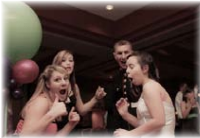
AN ENCHANTING EVENING FOR FATHERS AND DAUGHTERS.

Giggling girls and smiling fathers created a truly “Enchanted Evening” at the Fourth Annual Father & Daughter Dance as over 500 military fathers and their daughters enjoyed an evening of dining and dancing. An added attraction this year was a photo booth where adoring fathers allowed their daughters to “spruce them up” for pictures they “will never forget.” The San Diego ASYMCA thanks TriWest for their continued sponsorship of this memorable event.