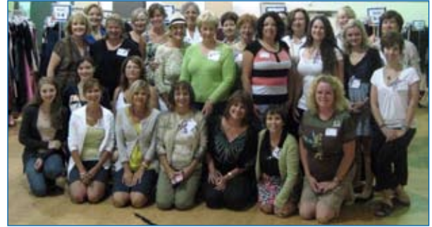
BALL GOWN VOLUNTEERS.

help spouses attend the Navy and Marine Corps birthday celebrations. We concluded the year by providing 500